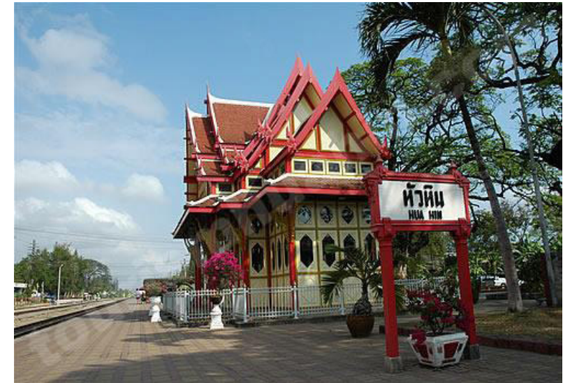
HUA HIN TRAIN STATION