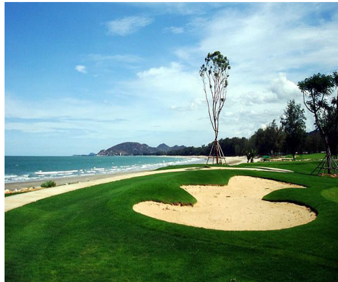
SEA PINE GOLF