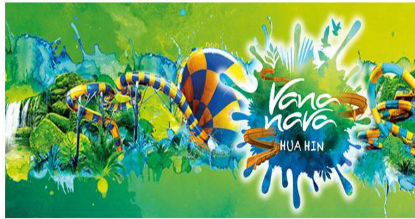
VANA NAVA WATER PARK