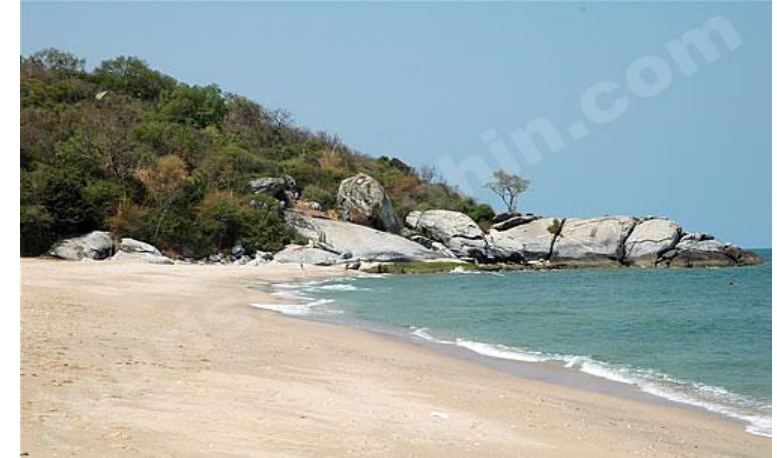
SAI NOI BEACH