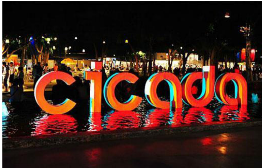
CICADA NIGHT MARKET